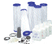
Extended Cruise Kit