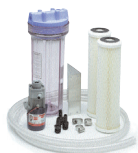
Silt Reduction Kit

For waters with high levels of suspended matter, e.g. in shallow anchorage, we would recommend you use an additional prefilter. This additional filter is finer (5 microns - 1 micron = 0.001 mm) than the standard filter (30 microns) and is placed after it. A booster water pump (12V/0.8 A/h) is also provided. This pump compensates for the loss through the second filter and increases water production. We would also recommend the prefilter kit when the Power Survivor is not installed under the water line and when it is in constant use to increase the intervals between servicing.