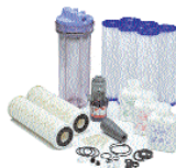
Preventative Maintenance Kit